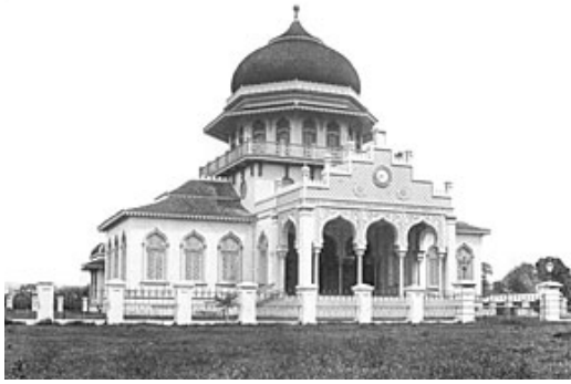
Figure 2. Indo-Arabic Cross Cultural Mix