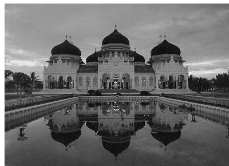
Figure 7. Baiturrahman Mosque in Banda Aceh. Power of Western hegemony and support the spirit of Pan-Islamism produce a reduced embodiment of the mosque into a dome or minaret.

Second, the emergence of colonial constructs created by the Orientalists as a form of Western hegemony over the Islamic culture and civilization in the colonies 4 . The concept of homogeneity and was created as a representation of Islamic identity to facilitate supervision and "domestication" of Muslims colonized. As a result, the complexity and simplified Islamic entities into a single image. According to the Orientalists, a mosque can be said to have Islamic features if you have the form of minarets and domes. Therefore, understandable that in the old mosque in Java that does not have a tower, the Dutch authorities added that the minarets of its subordination to the efforts of Islamic culture. Because of the strength of Western hegemony and support the spirit of Pan-Islamism, this interpretation is spread very far into the perception of the colonial countries, thus the embodiment of wealth thriving mosque previously reduced to a mere form of the dome and minaret. Baiturrahman Great Mosque in Aceh designed by Dutch architect in the conquest of Muslim society efforts in Aceh. This conquest of the Islamic identity of uniformity so that the people of Aceh will be identified and "controlled" (Figure 7).