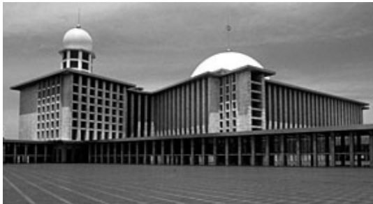
Figure 3. Modern Geometric

Departure from the above, at least two types of mosque architecture design in Nusantara. First, the mosque which uses only the local or the newcomers elements on the display its architectural form, which is homogeneous. Second, the mosque that integrate local elements with the newcomers in the architectural form of the display, so that is a hybrid. In other words, there are two point of departure in the design of the mosque in the archipelago, namely architectural homogeneity and architectural hybridity. Each provides the legitimacy of the architecture of identity formation.