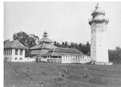
Figure 1. Vernacular Javanese

continuity of tradition and change towards modernity. In the context of relationships the local (Nusantara) with the newcomers ("Muslim" and Modern), occurs through the dynamics of the mosque rich architectural exploration, heading toward balance and a new identity.