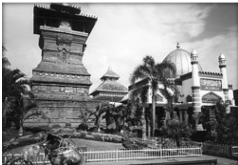
Figure 8. Al-Manar Mosque in Kudus. Section presents the porch roof of the mosque dome and the threshold arch

Unlike the region of Sumatra as Asian cross-trade in Malacca strait which have long mosque architecture under the influence "universal identity" Islam is a very intensive, a mosque on the island of Java in the early twentieth century also shows the presence of Pan-Islamic identity and resistance against . Masjid Al-Manar in Kudus as an example, presents the dome roof and forms a bow on the porch and at once the resistance do not to the elements of "universal Islam" is a major part of the building (Figure 8). Elements "outside" is just additional building attached to a pyramid-roofed mosque compound pre-existing. It's just that, combining the local and the newcamers elemets on the mosque was impressed as a patch that simplistic, naive, and without further processing.