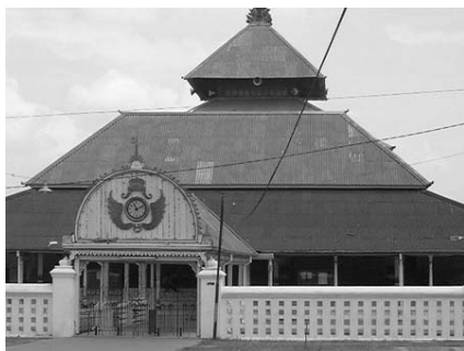
Figure 6. The variants Demakan type and Jogjakarta Great Mosque