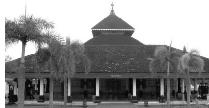
Figure 4. Demak Mosque has a form which refers to the local tradition of Islamic pre-existing (Meru). The mosque is a prototype development of mosque architecture in the archipelago in the next period.

In subsequent historical developments, the rise of a number of mosques "Demakan" (Javanese Vernacular) type throughout Nusantara. Mosque with this type generally have a form that takes the basic reference Demak Mosque as a continuity factor which has undergone a transformation as a factor of change. Singkarak Mosque in West Sumatra is an example that takes continuity piled pyramidal roof with the transformation of the roof ribs bending stacks (Figure 5). Bending ribs actually more as a form of adaptation to the home architecture archway usual, so that harmony can be achieved environment. In other developments also occurred moments where the elements of the newcomers combined or combined with the local elements without the need to eliminate or ignore one of the elements. Great Mosque of Jogjakarta, for example, combining the local elements ( Tajug of Java ) with external elements (form, which refers to European classical architecture ) (Figure 6). European classical