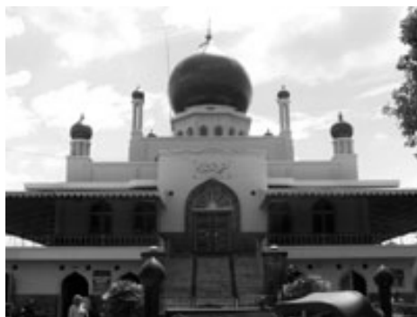
Figure 10. Syuhada Mosque in Jogjakarta. The design shows a synthesis between the local elements, Pan-Islamism and modern.

Condition hybridity mosque architecture can be seen in the emergence of a dynamic tension between the use of "outside/international" forms and resistance "local" in the manifestation of the architecture with a variety of interpretations and synthesis efforts. Through a rich architectural exploration -both a transformation and a combination, these tensions can be overcome and a new equilibrium has to offer. Hybrid identities and then came through the encounter format of the local and the newcomers, the old and new, the normative and critical, all of which shown on the physical form of the architecture. Faced with questions about the identity of the increasingly prominent, the complexity and contradictions in the design of the mosque should be considered, not avoided. So combining style "Java" with "Arab" for instance, is a challenge. Ambiguity or plurality of identities is the potential to produce "a new hybrid architecture" that enrich the architecture. Below are discussed the potential of hybrid architecture design Syuhada Mosque, the Mosque of UGM campus, and (plan) Padang Great Mosque.