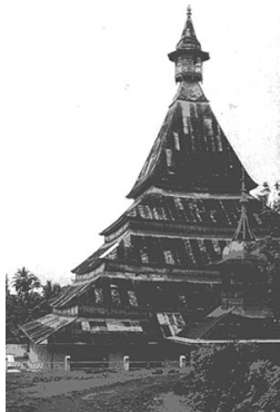
Figure 5. The variants Demakan type: Singkarak Mosque in West Sumatra

elements found on the crest of the roof attached to the roof of the porch, pediment form refers more neo-classical architecture of Europe. Another element is the ornamentation and decoration of the Neo-classical mixed with unique ornaments and decorations that are either Java or just patch together. Local resistance shown by not using the elements of the "outside" of immigrants as the main part of the building. These elements in most cases are treated as additional elements "attached" to the main elements of the local as a fixed element to dominate the display.