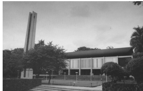
Figure 9. Salman Mosque in ITB, Bandung. Kubikal forms express geometric-mathematical beauty of a very rational.

composition of the primary forms of abstract and contrast to create a variety of characters that manifests itself in the form of a work. Salman Mosque (in ITB) are examples of expressions of modernism, departing from the composition of geometric forms ahistorical, simplicity, reveal the material and structural integrity, without ornaments and decorations, and specifically shows the integration of lines (trunks), field (plate), or a lump (of clay) (Figure 9). The presence of this express cubikal geometric-mathematical beauty of a very rational.