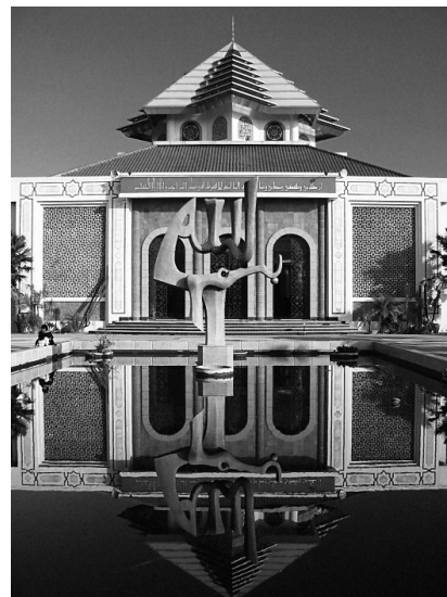
Figure 11. The Mosque of UGM campus in Jogjakarta. Islamic values articulated and brought into the context of Java, and traditions become a foothold into modernity.

In the design of the Mosque of UGM campus in Jogjakarta (Figure 11), looks interesting synthesis between the local aspects, the migrants, as well as the present. Local aspects seen through multilevel pyramid roof that takes a reference type "Demakan" (Javanese Vernacular). Aspects of the newcomers looked through the emphasis that invites the geometry Arabesk overlapping rectilinear pattern with 45 degrees of rotation into the formulation of "Islamic". This pattern applied to the plan of the roof top (brunjung) and "intercropping", even in the field of ornamentation patterns. Thus geometrically, the "Brunjung" is a merger of two pyramid roof with a rotation of 45 degrees. The present mosque is precisely because of the enrichment and development in many parts of the building as a result of the transformation and integration between contradictory elements: the local-the newcomers, old-new, tradition-modernity. Local elements in this mosque more ranking as "a subject that looked", because it still shows a strong local dominance both accommodative to the elements that were newcomers.