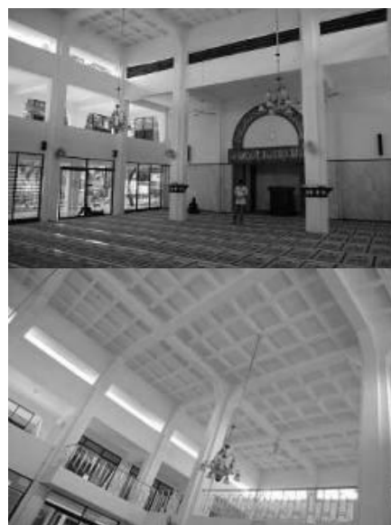
Figure 5. Interior of Masjid Baitussalam