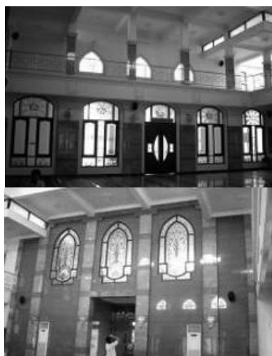
Figure 3. Interior of Masjid Nurul Iman

Meanwhile, Masjid Nurul Iman (Figure 3 - 4) is located at Margorejo Indah Estate, Surabaya. The south and the north side of this mosque is the highest source of noise, while the west side bounds with the residential buildings and the east side is