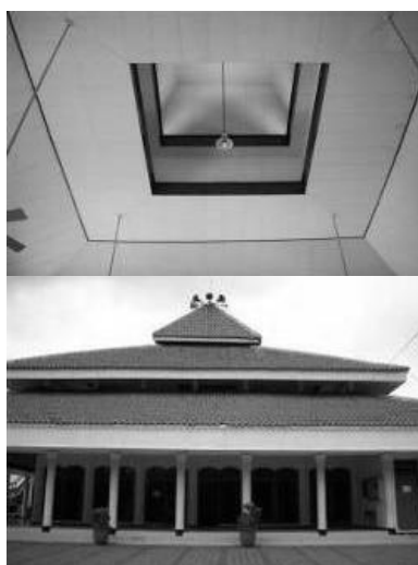
Figure 2. The ceiling (above) and exterior (below) of Masjid Al-Maghfirah

Masjid Al-Maghfirah is located at Rungkut Asri Estate Surabaya. This building is surrounded by residential buildings, except the south side that is exactly next to the road. This side is the highest noise source for the building. The plan shape is square (Figure 1 - 2), while the ceiling shape is crown. The mosque's dimension is 14,5 x 14,5 x 8 m 3 . The composition of materials in this mosque are some reflection materials, which are glass window, glass door, brick plester wall, and ceramic tile on wall. All area of the floor is covered by carpet. The area of opening is 23% of wall area, which could decrease the reflecting area.