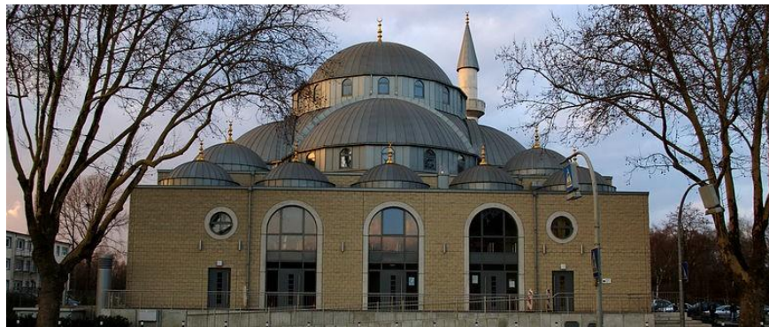
Fig. 1. Marxloher Merkez Mosque, (“Merkez Moschee, Marxloh”, 2011)

Marxloher Merkez Mosque, designed by the Turkish - German architect Cavit Şahin, is a much more direct depiction of the Ottoman style compared to other Turkish mosques in Germany. The external structure of the mosque is dominated by a dome structure that includes a central dome and four half-domes around it. The entrance hall is covered by five small domes placed relatively lower than the level of the central dome structure. The 23-meter-high dome is complemented with a single 34-meter-high “pencil form” minaret typical of the Ottoman period (Korn 2013).