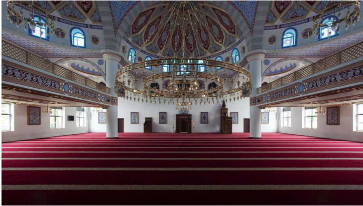
Fig. 2. Marxloher Merkez Mosque ("Merkez Moschee, Marxloh", 2011)

Due to its foreign style, the mosque stands out from the rest of Marxloh's urban landscape with its minaret and ensemble of domes and half-domes. Although mosques are becoming a more familiar element in German cities, according to Gorzewski three characteristics of the Merkez Mosque make it a unique one (2015). The first feature is related to the size of the mosque. At the time of its opening in 2008, Merkez Camii was the largest mosque in Germany with its capacity of 1200-people.