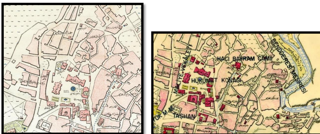
Figure 6. Hacı Bayram Mosque and Government Square in 1924 Map

The first construction is 1427-1428. However, with todays vision 17-18. Century features. The main structure originally planned as a small mosque was inadequate due to the population increase in Ankara, especially its immediate vicinity.