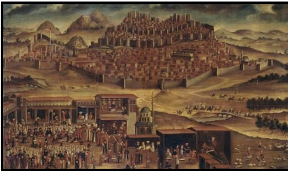
Figure 3. Ankara in the 18th Century