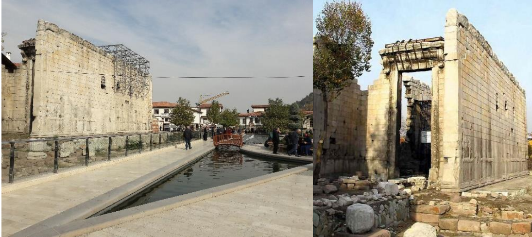
Figure 5. New pool and sitting places showing changing elements around Augustus Mosque

The Temple of Augustus was built to be a sign of commitment for the Roman Emperor Augustus. The Temple is surrounded by a peristasis in the Corinthian order, which contains 8 columns on the short sides and 15 columns on the long sides. (Fig. 5).