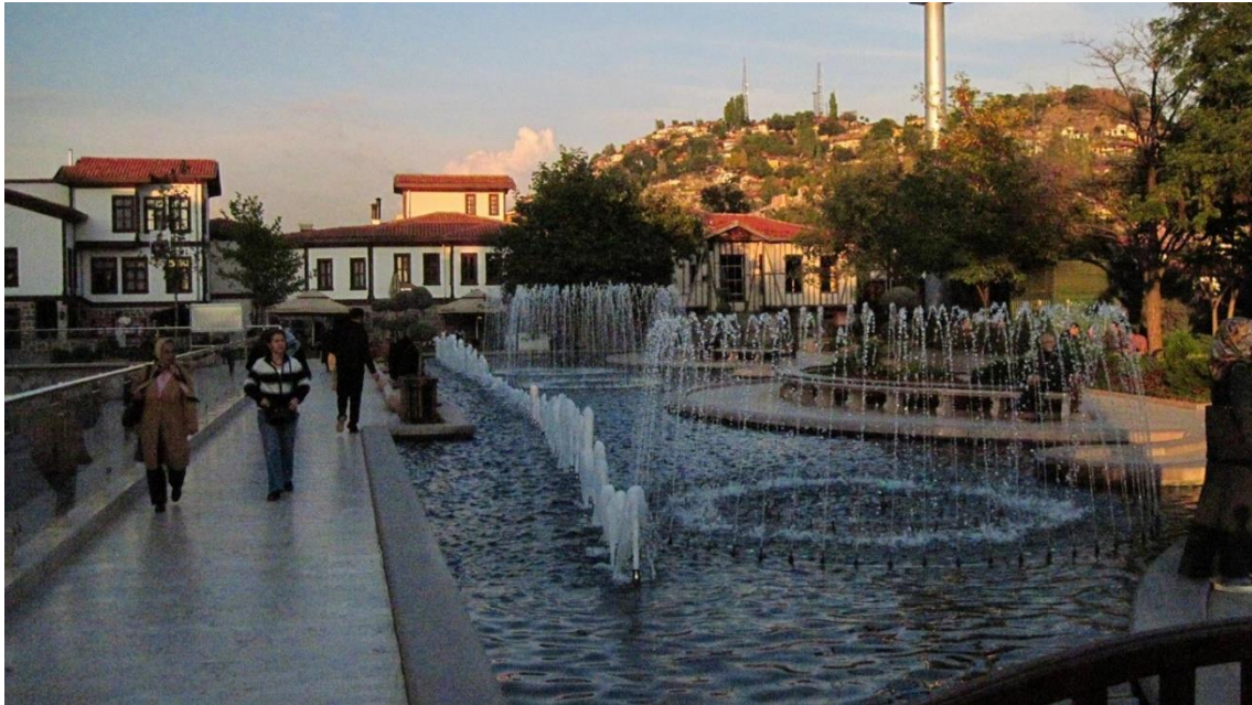
Figure 7. New pool and sitting places showing changing elements around Augustus Temple and Haci Bayram Mosque

The Regional Board of Ankara of the Regional Board of Protection dated 26/02/2010 and numbered 4895. "The statement of" as the pool of ornaments "as a dry swimming pool, and also by the Ankara Renewal Area of the KTV Regional Board dated 04.09.2009 and numbered 446, the park-related part will be changed and the pool-related section will be changed to the Ankara Regional Directorate for Conservation of Cultural and Natural Heritage.