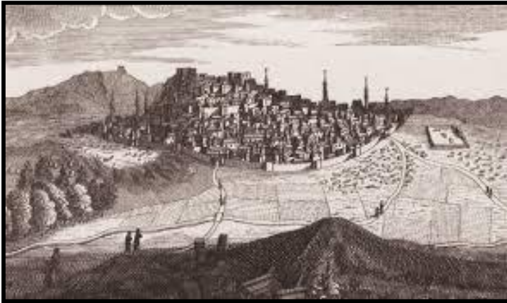
Figure 2. Ankara in 1717 (Archieve)