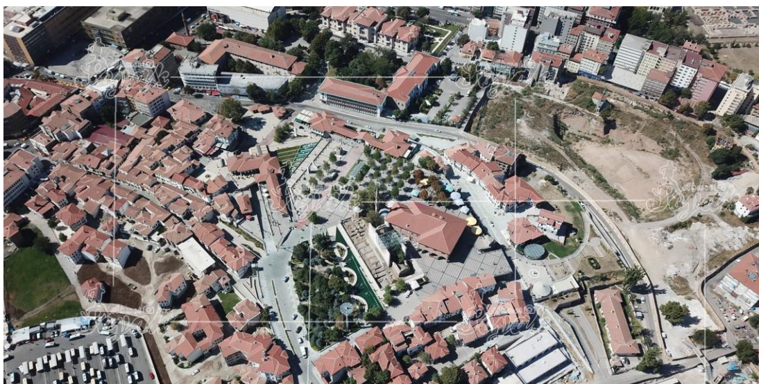
Figure 8. Hacı Bayram Mosque and environs after renovation works

"Hacı Bayram Veli Mosque Restoration and Environmental Regeneration Project" was accepted by Ankara Regional Directorate of Preservation of Cultural and Natural Assets Decree of 26.02.2010 and numbered 4897.