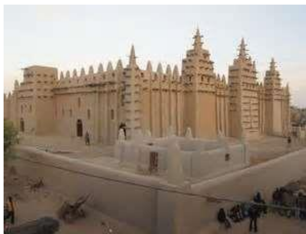
Pic. 2 : A mud mosque in Mali that contains no stereotyped elements of domes, minarets or onion arches

In modern times, architects can design buildings according to almost any language but they are pressed by clients to pursue the stereotyped ‘Middle-Eastern’ dome, arch and slender minarets. Whilst some architects do try to argue for a more modernistic and progressive language, their views are almost always vetoed by the committee. Some architects prefer to follow the client’s ‘Arabian Nights’ interpretation of mosque architecture because their fees are connected to the more expensive proposals of many domes and multiple minarets. This situation gives rise to the deepening problem