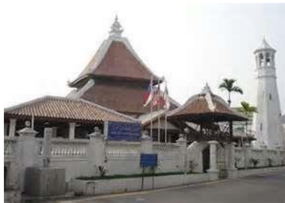
Pic. 1 : Kampung Hulu Mosque in Melaka, 17th century

such as the Pharaoh, the buildings tend to be modest in scale. The palaces of monarchs and Rajas dwarfed these buildings with their grand scale and ornamental opulence. The mosque then was more in tune with the surrounding people as there were not many religious institutions to govern certain rules and regulations. Everything went under the simple purview of respect for the rules and behavioral conduct of the religious teacher or scholar and those of his students. The relationship between Muslims and non-Muslims were probably less estranged as they are today and we can see Muslims and non-Muslims living side by side and entering mosques and temples without due concern. Indeed this was the experience of many past lives before the advent of the television and the Internet that shook the foundation of social relation by news in another unrelated province being imposed on another that had no issue to begin with. Actions of self-interested leaders who seek political dominance and survival, the television and the Internet have succeeded in isolating Muslims more and more from the rest of the world.