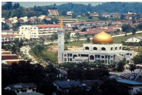
Pic. 3 : Masjid Abu Bakar As-Siddiq during the early years upon construction.

In order to obtain a balanced perspective of the integration of the mosque community towards the society, a survey was carried out with a targeted group of respondents made up of non-Muslim community. The respondents in this research will all be coming from one single location – the surrounding housing area next to the Saidina Abu Bakar AsSiddiq Mosque. This sample is relevant due to the proximity of the housing area whereby the residents daily activities will have a direct or indirect relation to the mosque. The selected respondents should also be a permanent resident for a prolonged period to affirm the perception built. The randomly sampled respondents will be asked by the researcher for consent and approval to answer the survey. The survey contains a list of questions as pertaining to whether the residents have ever visited the mosque for some occasion or whether they have ever used the facilities at the mosque.