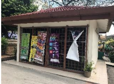
Table 2 - Social contextualism of the mosque.

This section is about the finding concerning the social contextualism of the mosque.