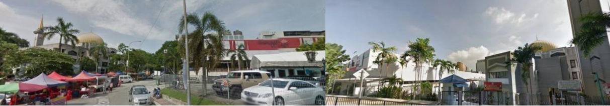
Table 1 - Physical contextualism of the mosque.

This section is about the finding concerning the physical contextualism of the mosque.