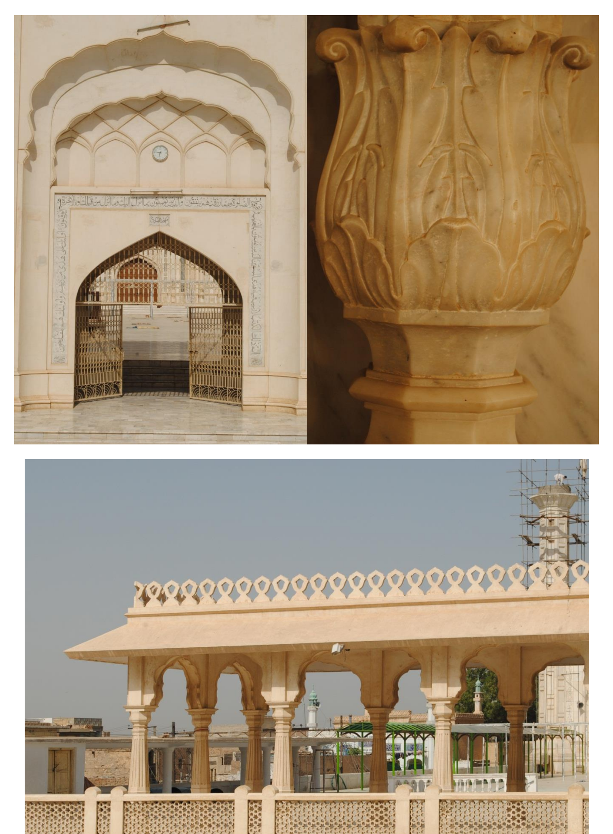
REFERENCES [1] Al-Sadiq Mosque Bahawalpur, Available at online Wikipedia