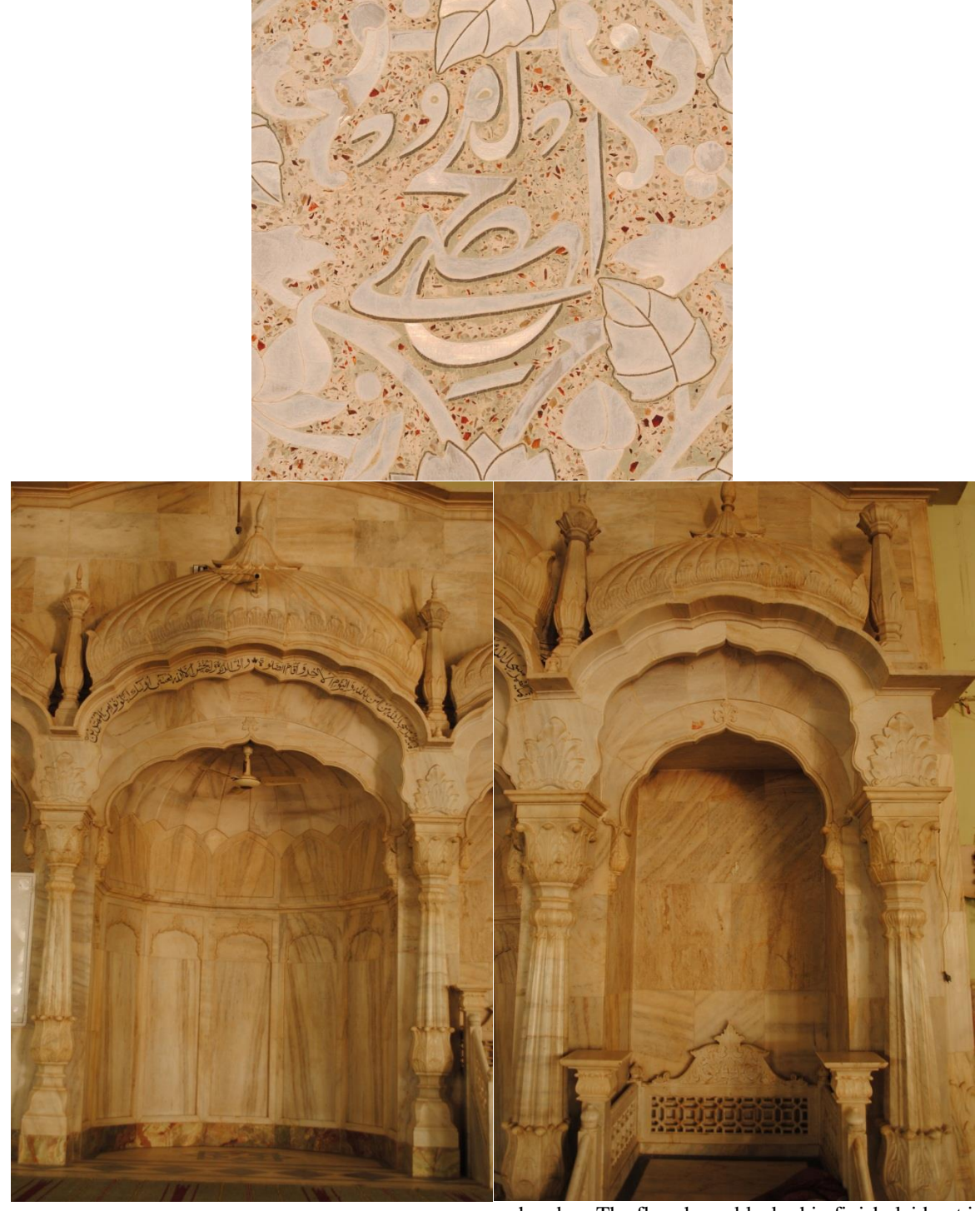
The mimbar is constructed of the same material as the mebrab, and set in a small area of interest at the north stop of the