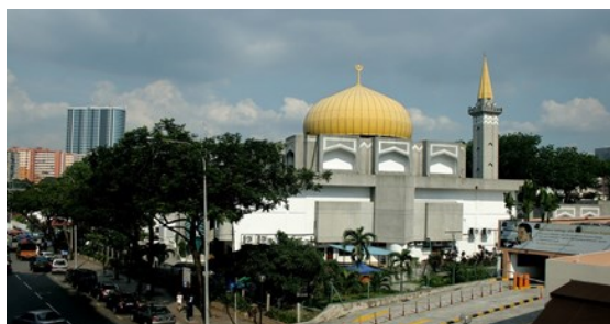
Figure 1. Saidina Abu Bakar As Siddiq Mosque

The mosque consists of three levels. The mosque's ground floor has classrooms for religious classes, office space, and a public library. A multipurpose hall that can accommodate up to 200 people with an adjustable wall partition is for conferences, religious classes, a public canteen, a public toilet, and places for ablution. Whereas the first floor houses the main praying space for daily use for up to 1,000 people. The other areas have a maximum capacity to accommodate 4,000 people during Friday prayers. The second floor consists of additional space for Friday prayers and special occasions. The west side of the building is attached to classrooms and offices for the young religious school, Sekolah Rendah Agama Abu Bakar Al-Siddiq. The east side of the mosque comes with accommodation to house Imam and multilevel parking spaces dedicated to the administration (Figure 1).