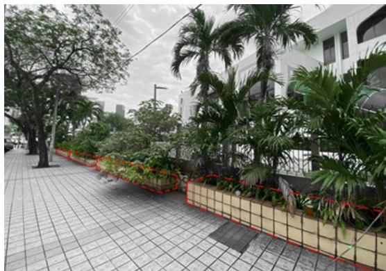
Figure 9. The planter box around the perimeter of Saidina Abu Bakar As Siddiq Mosque

The territoriality of the building is the analysis of the mosque's architecture on whether the spaces portray "friendliness" or "openness" to the public in general. In this section, we analysed the mosque based on these aspects from the perspective of non-Muslims visiting the mosque.