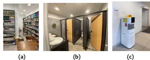
Figure 12. (a) public library, (b) toilet, and (c) water dispenser. Examples of public friendly elements in Saidina Abu Bakar As Siddiq Mosque