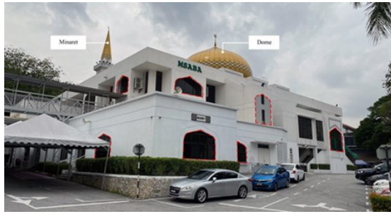
Figure 4. Iconic imagery of Saidina Abu Bakar As Siddiq Mosque (Author)

The mosque consists of elements reminiscent of populist Islamic architecture, highlighted in figure 4. Domes, minarets, and arches are commonly seen in populist Islamic architecture. However, this mosque does not overly emphasize such features. The minaret's height of 43.3 meters, the dome's diameter of 16.6 meters and 24 meters in height, coupled with the moderate use of arches in the windows and openings at the face of the building, complement well in the size and massing of the building.