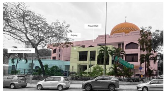
Figure 3. Scale and massing of Saidina Abu Bakar As Siddiq Mosque

Additionally, the scale and massing of the building also reflect well into the building typology of the site. Regarding the massing breakdown, similar elements reflect the space planning of vernacular Malay house architecture, such as the introduction of Anjung as the foyer or waiting area. The administration office, detached from the main building and consisting of the prayer hall, complements the architecture of the surrounding typology in terms of its height and does not emphasize dominance in the surrounding context (Figure 3).