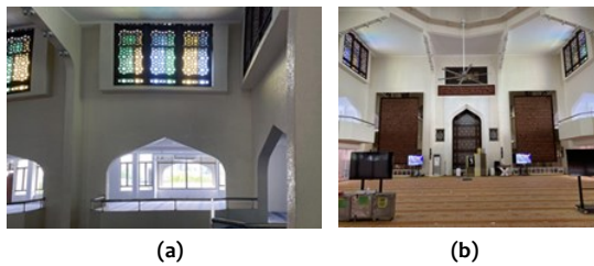
Figure 5. (a) and (b) Interior space of Saidina Abu Bakar As Siddiq Mosque

The mosque consists of elements reminiscent of populist Islamic architecture, highlighted in figure 4. Domes, minarets, and arches are commonly seen in populist Islamic architecture. However, this mosque does not overly emphasize such features. The minaret's height of 43.3 meters, the dome's diameter of 16.6 meters and 24 meters in height, coupled with the moderate use of arches in the windows and openings at the face of the building, complement well in the size and massing of the building.