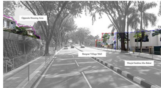
Figure 2. Saidina Abu Bakar As Siddiq Mosque and its context (Author)

The analysis of the perception of the building, Saidina Abu Bakar As Siddiq Mosque determines how the mosque portrays itself in the public's eyes. First, in the sense of material and finishes, which identify whether it complements the surrounding building typology, whether the scale and massing of the building overwhelm the neighboring buildings in terms of the volume, and finally, whether the mosque portrays itself as traditional Muslim architecture.