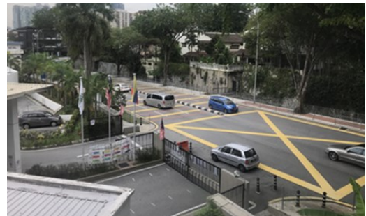
Figure 8. The main entrance of Saidina Abu Bakar As Siddiq Mosque

In Figure 7, it shown the interior perspective of the prayer hall of Saidina Abu Bakar As Siddiq Mosque. Large and clear openings can be found around the prayer hall, which provides visibility to the public. Thus, the activities within the inner sanctum are visible to everyone. This visibility will eventually create the message of "sharing" and "friendliness" to outsiders