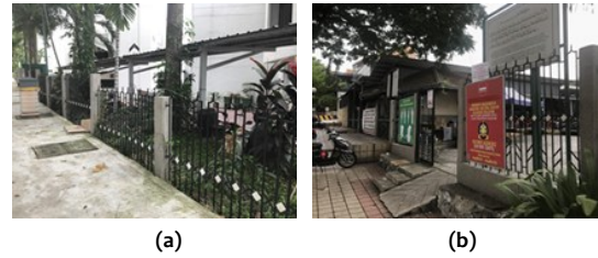
Figure 6. (a) and (b) are a Main gate and fencing of Saidina Abu Bakar As Siddiq Mosque

This section analyses and discusses the visual permeability of the overall mosque. Visual permeability can give people a sense of belonging, no matter which cultures and ethnicities they belong to. More visual permeability would portray a friendlier and inclusive religious building to the people, not a private entity but a public one.