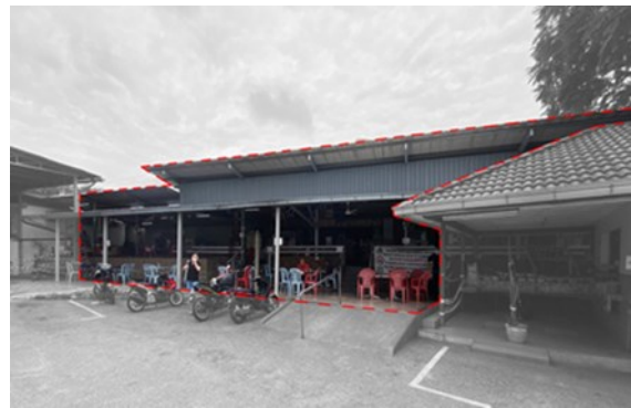
Figure 10. Public canteen in Saidina Abu Bakar As Siddiq Mosque

Additionally, complementing the rear entrance shown in figure 7, there is access straight to the public canteen of the mosque, as shown in figure 10. This entrance opens at dusk and closes at dawn. The gate was kept open all day, which allowed visitors or passers-by to have their meal at the canteen regardless of race and religion. The opening of such a space portrays the message of "acceptance" to the general public.