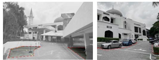
Figure 11. (a) Private parking and (b) Public parking in Saidina Abu Bakar As Siddiq Mosque (Author)