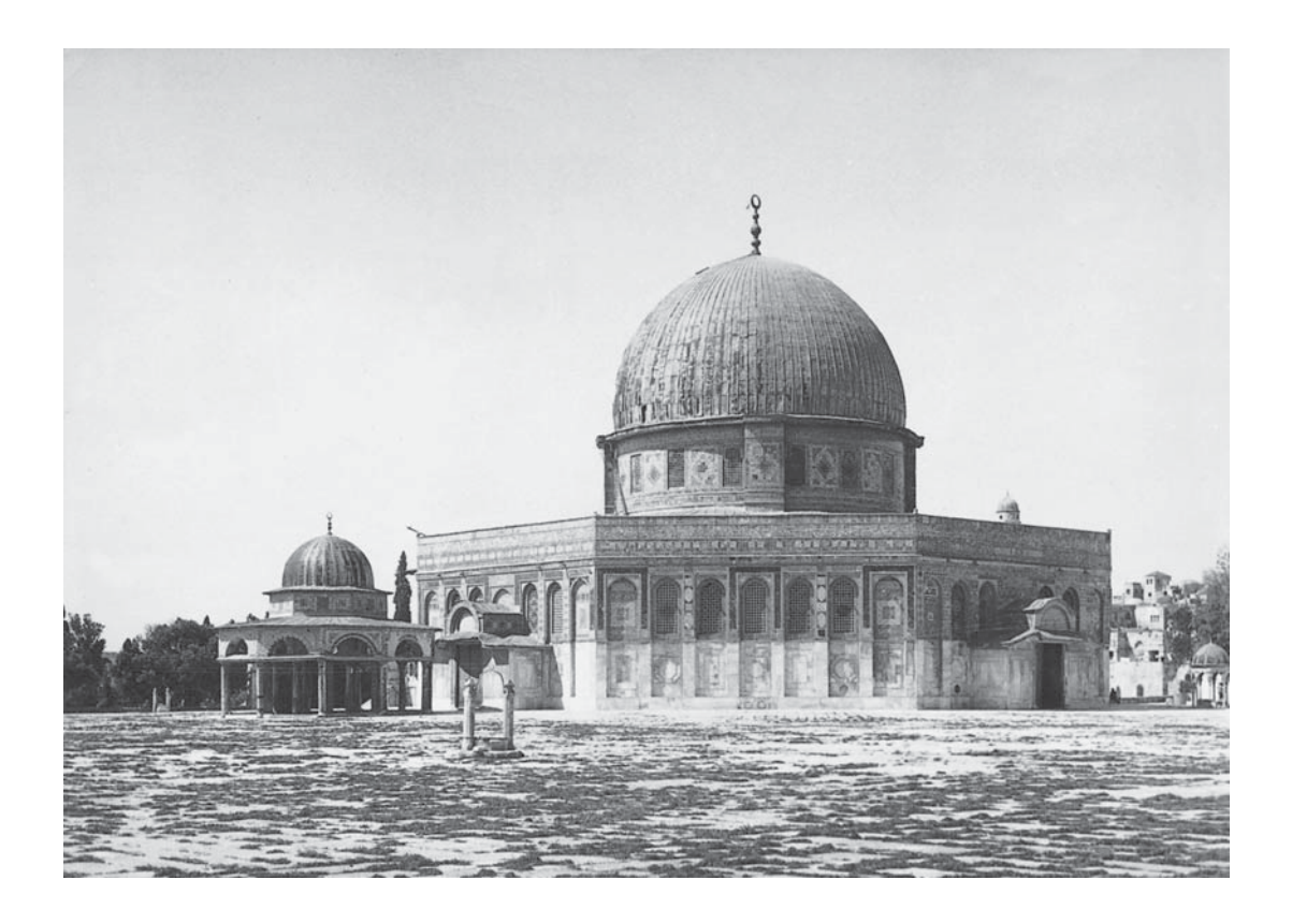
The Dome of the Rock,Jerusalem

Why not remain satisfied with the immense progress over the past fifty years in our knowledge [52] of facts about Islamic architecture and in our organization of this information into reasonably accepted categories?<sup>3</sup> Two reasons not to, I believe, have emerged over the past decade. One derives from my involvement over the past several years with the activities of the contemporary architects and planners, Muslim and non-Muslim, who are reshaping the face of the whole Muslim world. The questions they ask are never: who built something? and why?, but nearly always: what is Islamic in this? and how can I, a modern builder (frequently alien to Islamic culture), use the traditional past and its monuments to create something today? From the point of view of real contemporary interests, this is necessary information – like the knowledge of anatomy for a doctor. In other words, out of the taxonomic order of knowledge, something is expected that is not normally required. I shall return to this expectation in my conclusion – but let me