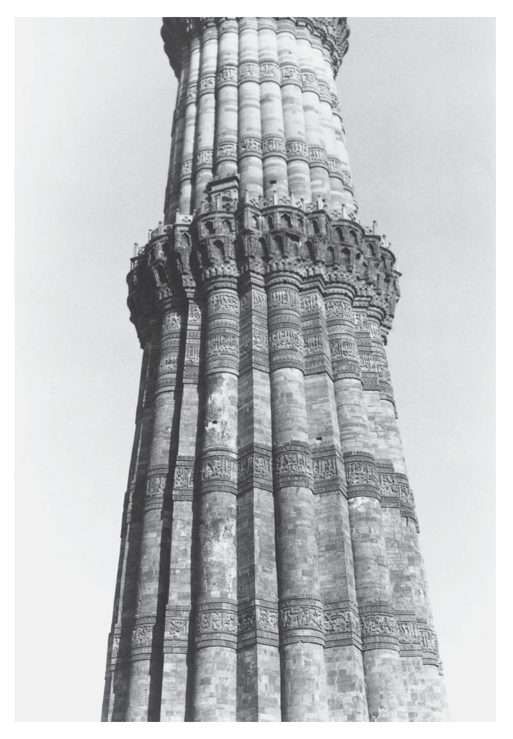
6 Qutb Minar, Delhi