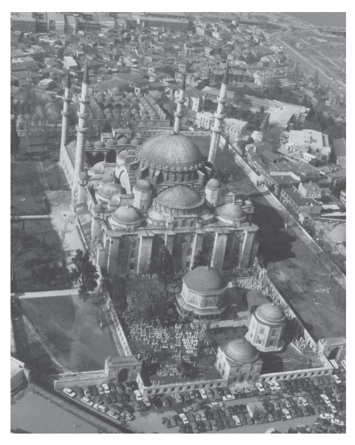
4 Ottoman imperial mosque: Suleymaniye, Istanbul