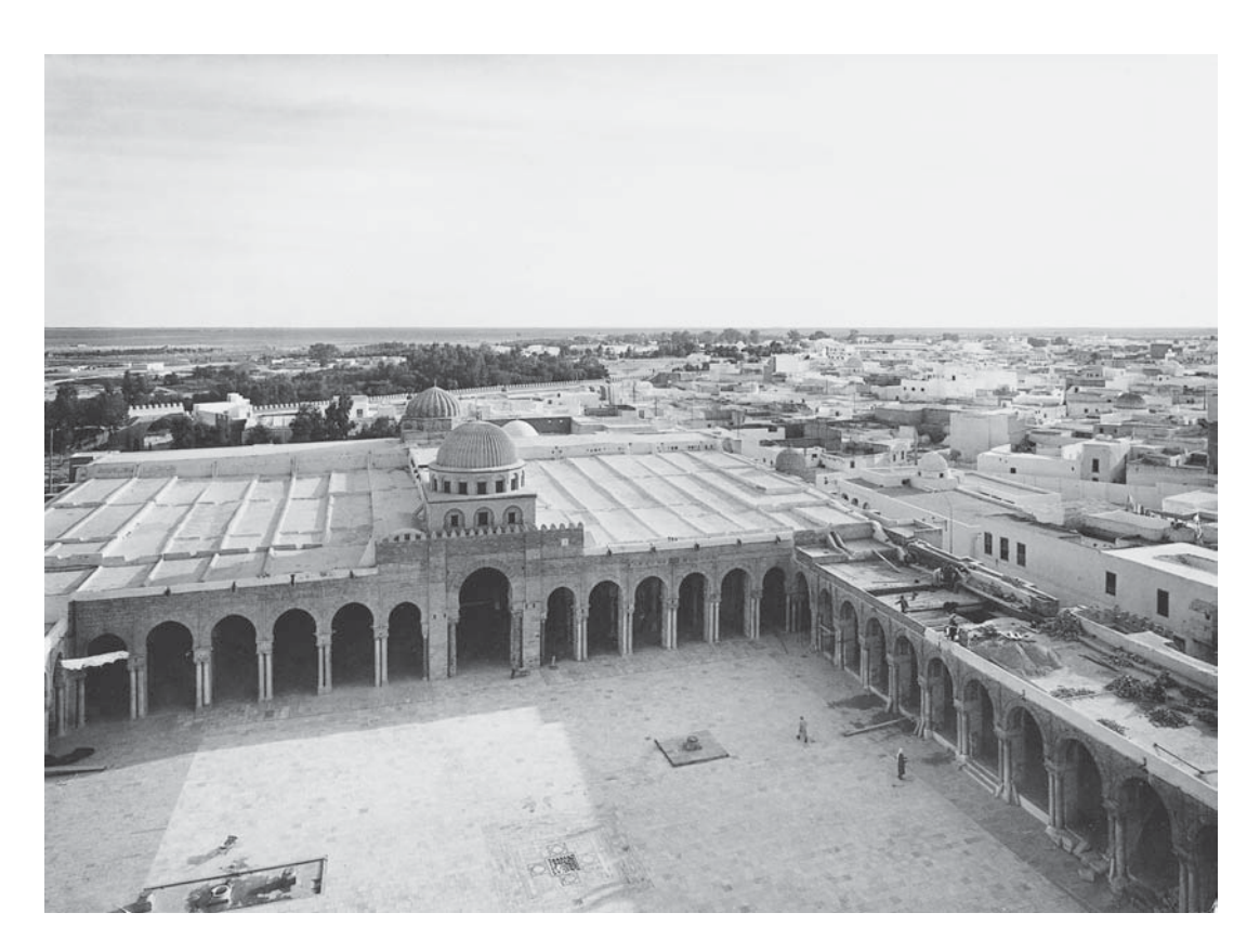
5 Hypostyle mosque: Great Mosque of Qairowan

state, the hypostyle mosque provided the architectural form through which the presence of the faith could most easily be expressed. Why? There may be practical reasons, for instance, the possibility of creating a space tailored to any size of community (the hypostyle is an unusually flexible form) or the absence of a hierarchy of parts reflecting the equality of the Faithful. But a more profound explanation is that the hypostyle form remained in the collective memory of Muslims and was associated with an early, unadulterated Islam, and that it expressed that view of itself that the Muslim world was particularly anxious to project.