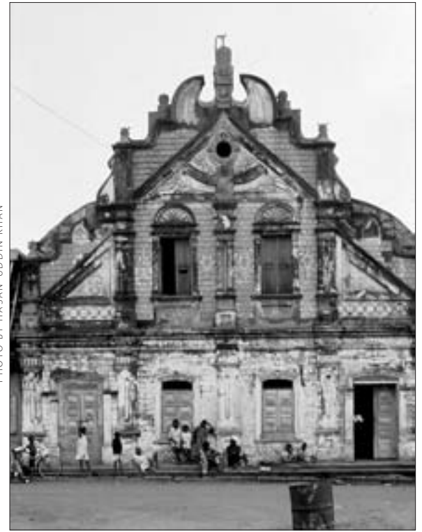
Community mosque, Aborney, Benin

ments. Is it apparent as a mosque? For some it is not. Some fifteen years after its completion the architect met with the clients and users of the project who said that they wished the mosque had had a minaret and dome so that it could be “perceived” to be a mosque.