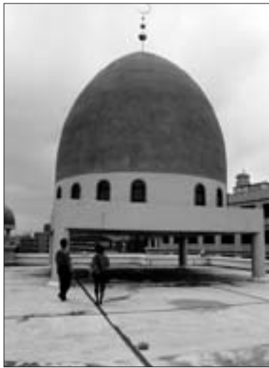
Domed mosque, Shanghai