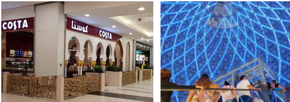
Figure 3a. Sheikh Zayed Grand Mosque underground tourist facilities; 3b. Escalators and prismatic glass dome