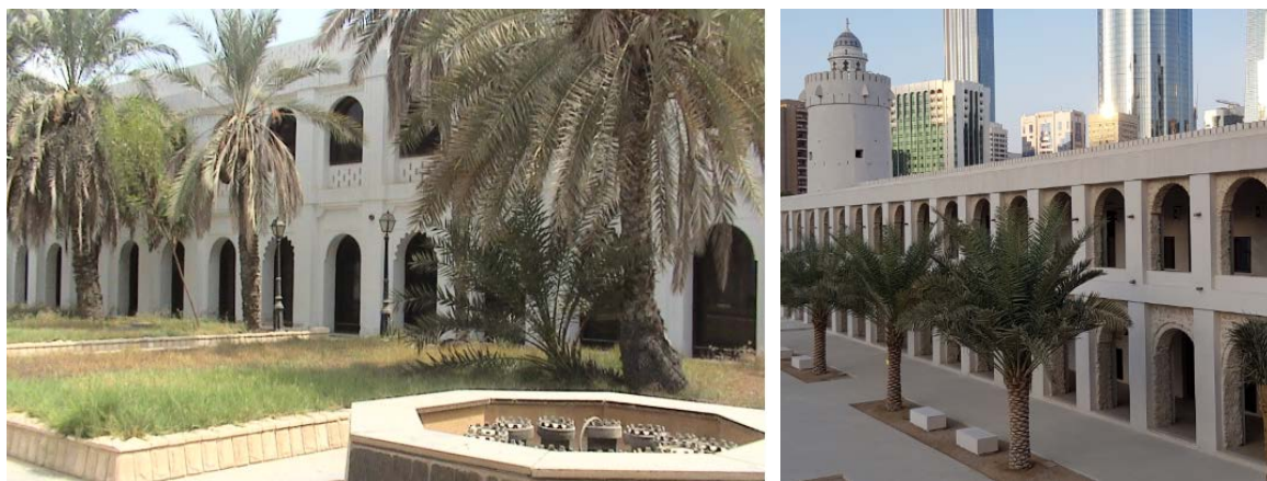
Figure 1a. Qasr Al Hosn before restoration, 1b. After restoration