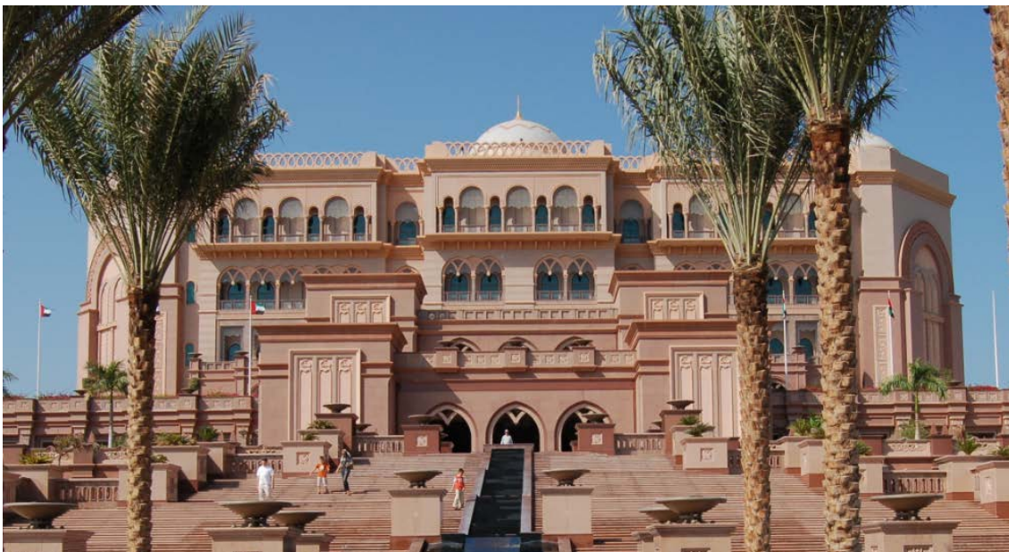
Figure 5. Emirates Palace Entrance and landscape

In Both complexes, postmodernism is explored to its fullest extent in the form of gathering ornaments and architectural motifs from a wide range for vocabularies and cultural produce from Mughal India to North Africa and Spain. However, when comparing the Emirates Palace Qasr Al Watan, it is observed that in the latter, more elements from local Emirati architecture have been integrated with