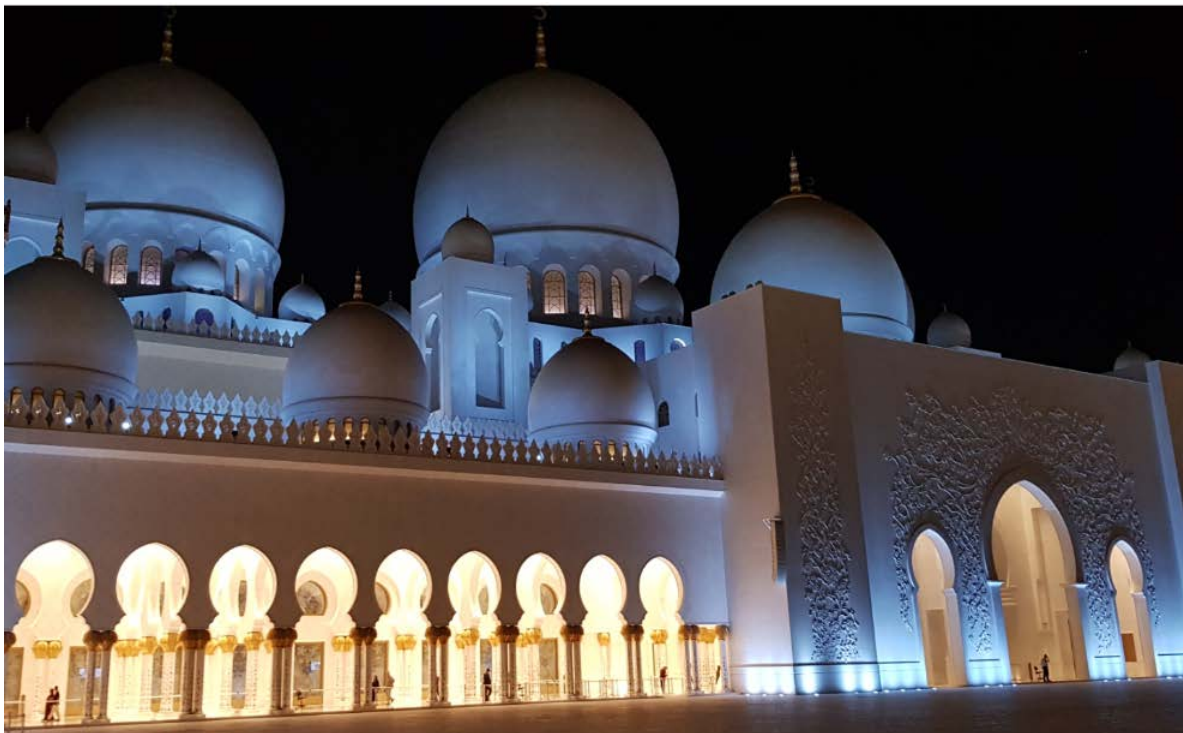
Figure 2. Sheikh Zayed Grand Mosque; domes, colonnade entrance from the courtyard