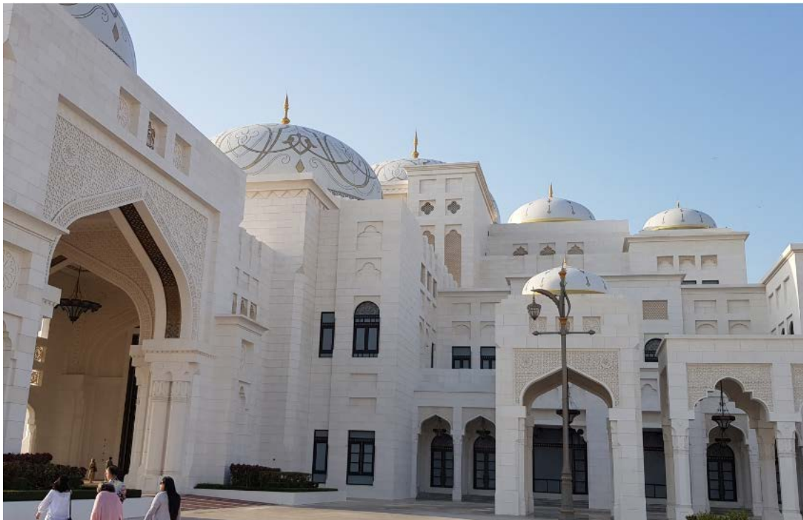
Figure 6. Qasr Al Watan entrance and domes

There is a certain sense of formality about Qasr Al Watan associated with palatial complexes such as the historical Topkapi Palace in Istanbul with its vast gardens and multi-layered styles accumulated overtime. In Qasr Al Watan layers of history have been compressed in time and space. This is supported by a museum like a curatorial process that commences at the visitor center where visitors are given leaflets about the building, taken by buses from the entrance to the main building and informed that they are not allowed to wander in the gardens of the palace grounds. The interior of Qasr Al Watan displays more intricate replications of the past, in comparison to the Emirates Palace where post-modernism manifest is an orientalist approach to the application of ornaments in combinations that indicate lesser attention to historical timeframes and homogeneity. Qasr al Watan's symmetrical Grand Hall exhibits glossy forms and fragments of Islamic ornament including pointed arches with