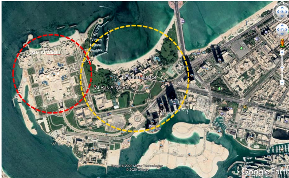
Figure 4. Qasr Al Watan and Emirates Palace top view and landscape [14]

with chamfered corners is reached via a long series of steps with water cascading downwards in the center reaffirming traditional design principles such as symmetry, the relation of water and landscape to palatial complexes (Figure 5).